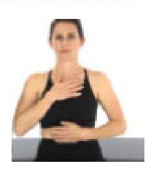
Effects of Hyperventilation: